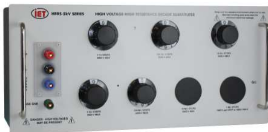
Figure 1-1: Example of an HRRS-5kV unit with 7 decades

The HRRS 5kV and 10kV series complement the HARS series which provides resistance steps as low as 1\text{ m}\Omega . The units may be rack-mounted to serve as components in measurement and control systems.