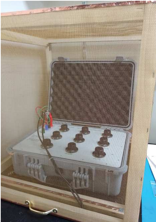
Figure 3-1: HRRS-WT in faraday enclosure

If this instrument is to be stored for any lengthy period of time, it should be sealed in plastic and stored in a dry location. It should not be subjected to temperature extremes beyond the specifications. Extended exposure to such temperatures can result in an irreversible change in resistance, and require recalibration.