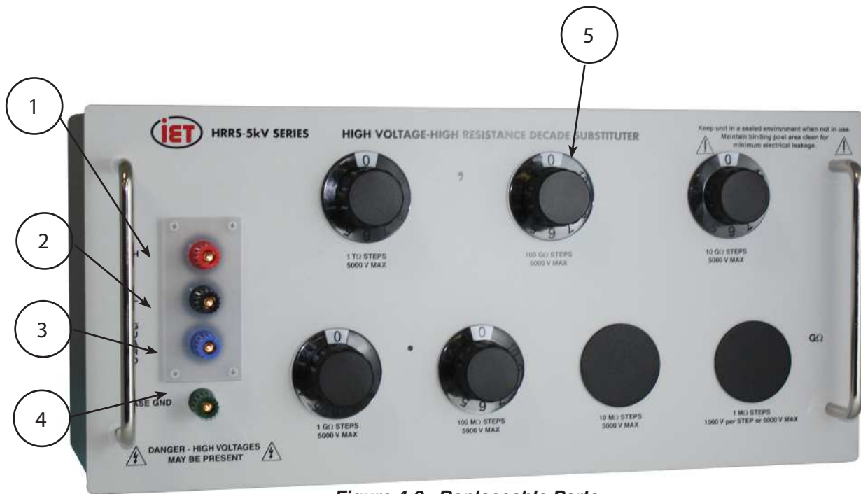
Figure 4-2: Replaceable Parts