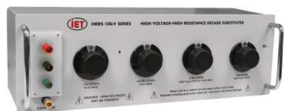
Figure 1-2: Example of an HRRS-10kV unit with 4 decades