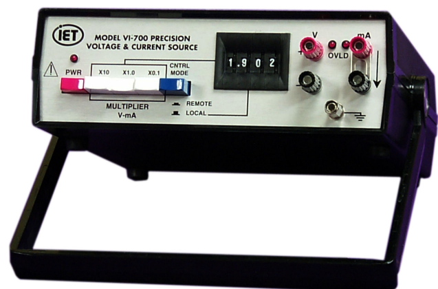
Figure 1.1: VI-700 Manual or Programmable Voltage and Current Source

Front panel overload indicator lamps warn of exceeding of voltage load or current compliance limits. This feature assures the user that the output is within specifications without having to make any measurement or computations. The standard model may still be used within the overload condition and will function for approximately 50-100% overload with only a slight degradation of specifications.