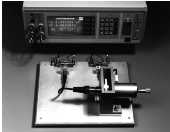
Figure 2: 7000 Series Precision LCR Meter connected to a Dielectric Cell

To check the toner, a powder sample from a production batch is compressed into a hard disk, 40 to 60 mm in diameter and about 3mm in thickness. In this particular application the sample is tested using a dielectric cell as illustrated in Figure 2. In simplest terms a dielectric cell can be thought of as a test fixture consisting of two parallel plates (with adjustable spacing) between which a material can be installed for measurement of electrical properties.